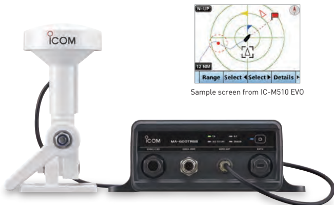
Sample screen from IC-M510 EVO